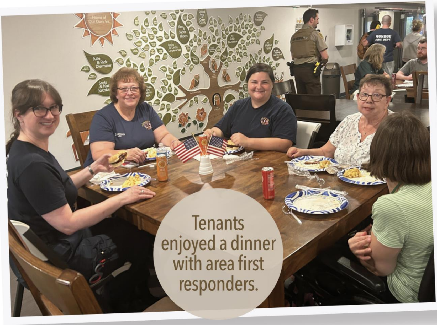
Tenants enjoyed a dinner with area first responders.